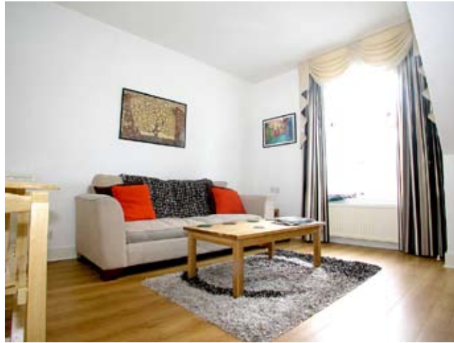
lounge - alternative view